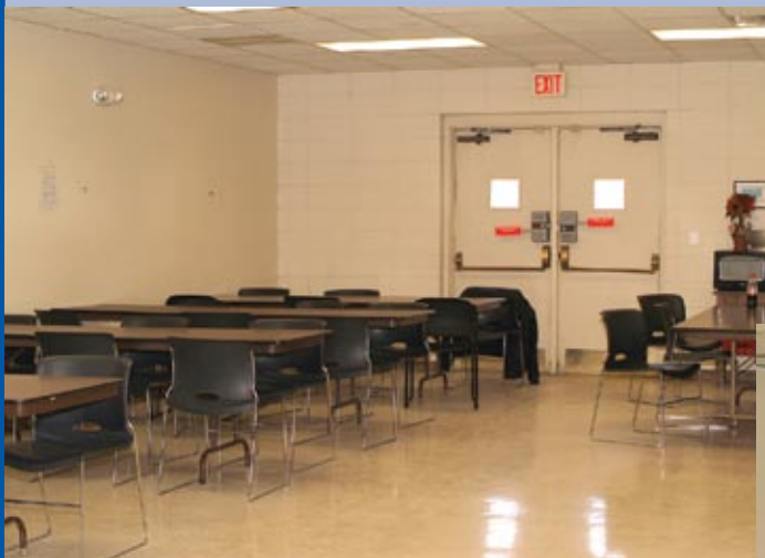
◀ The former dining hall, which will become the Outpatient Services area of the building.