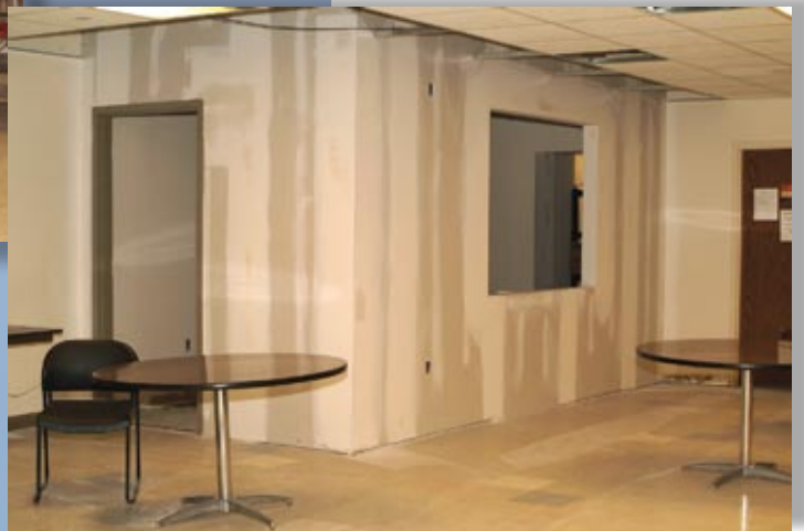
The area soon to become the new dining hall at the Park Street facility. ▶